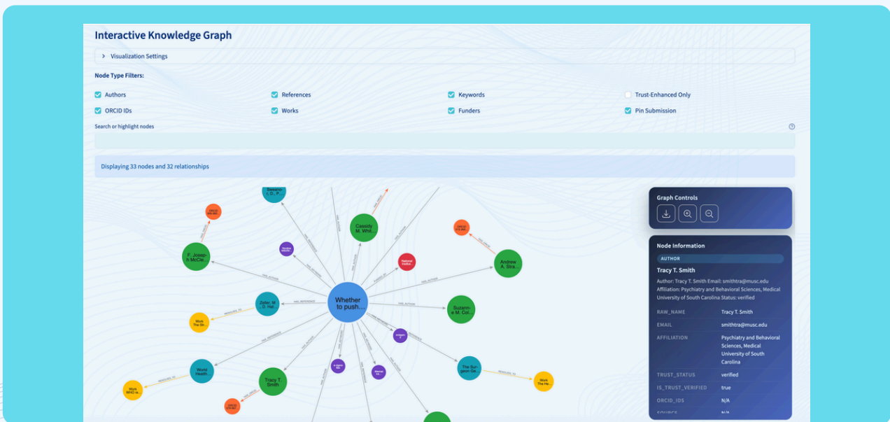
Figure 5: The interactive knowledge graph visualizes relationships between the manuscript (center), authors (green nodes), references (cyan nodes), ORCID IDs (orange nodes), works (yellow nodes), keywords (purple nodes), and funders. Different colors and connections to show the network of entities extracted from the manuscript.